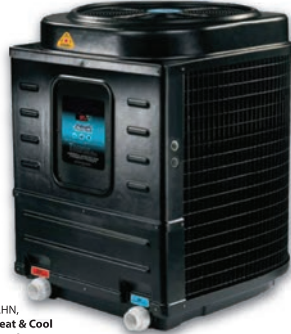
PRO1400AHN, PRO1400ARN Heat & Cool and PRO1500Q

Contact your HornerXpress® Representative to order today