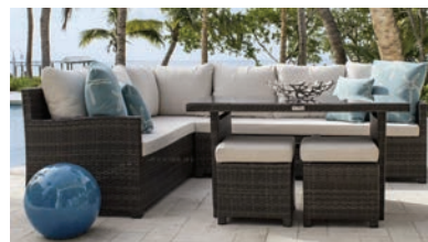
Spectrum sectional dining set

Contact your HornerXpress® Representative TODAY to place your first order