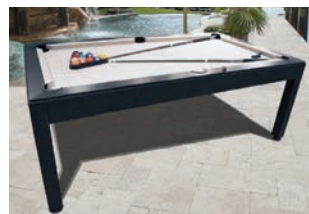
Panama Jack billiards